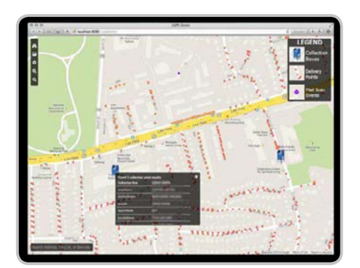
FIGURE 2: ZOOMED IN AREA SHOWING COL-LECTION BOX METADATA WHEN SELECTED.