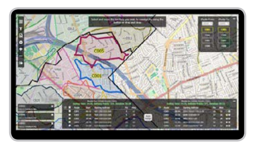
FIGURE 3: TERRITORY REASSIGNMENT TOOL SHOWS TWO ROUTE BOUNDARIES AND THE ACTUAL TERRITORY SECTIONS WITHIN THEM THAT CAN BE MOVED BETWEEN THE TWO ROUTES.